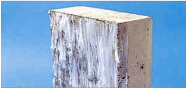
Emer-Stop Creme freshly applied

During or on completion of the works the client will mark areas to be tested for depth of penetration by testing at a minimum rate of one core per 300 m 2 of treated concrete.