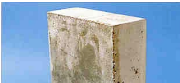
2 hours after application