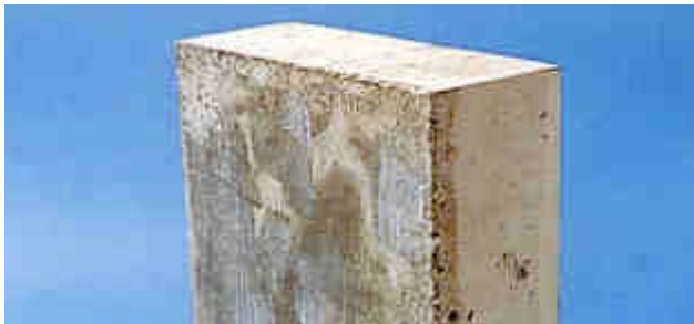
30 minutes after application